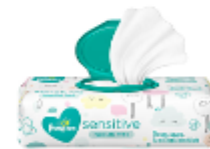
2 packs of baby wipes

Classroom Wish List: AA batteries, clear tape, post-its, Lysol spray, Construction paper, lamination sheets