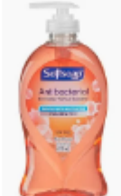
2 bottles of hand soap