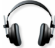
1 pair of kids headphones