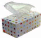
1 box of tissue