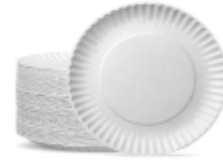
1 pack of small and large paper plates