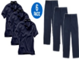
uniform: navy blue pants and navy blue shirt