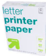
1 ream of copy paper (500 sheets)