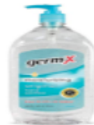
1 big bottle of hand sanitizer