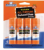
2 packs of Elmer's glue sticks