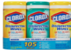
1 pack of Clorox Wipes