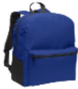
*1 backpack large enough to fit a binder*