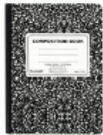
1 *primary* composition notebook