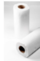
2 rolls of paper towels